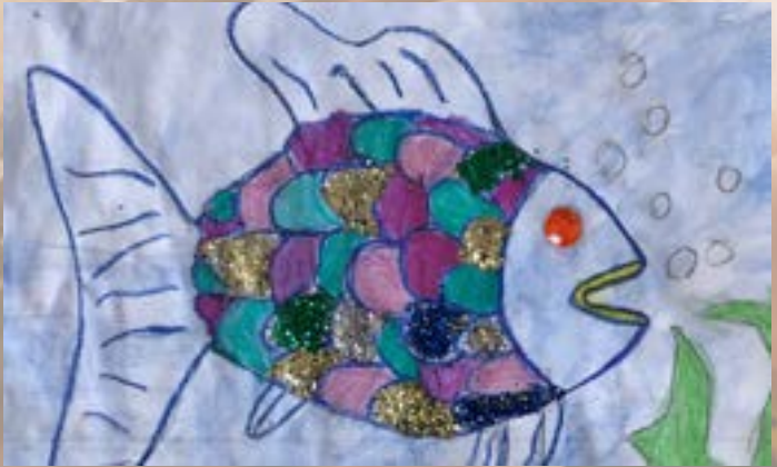
-By Namritha Roy 4A