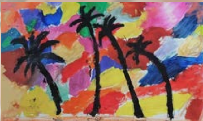
-By Nuha Khan 3A