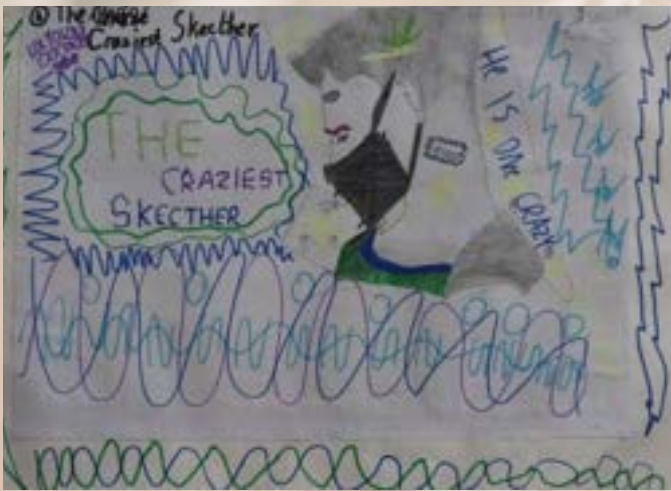
-By Akash Biju 3C