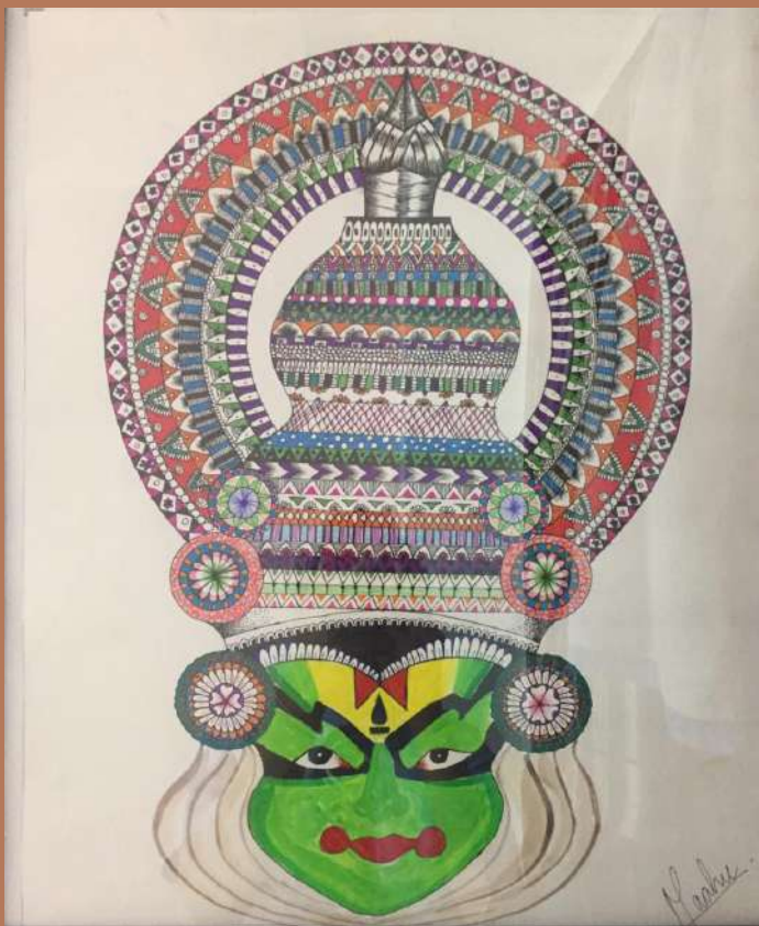
BY MAAHEE 12-D