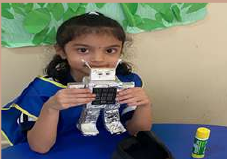
Create an Imaginary Robot