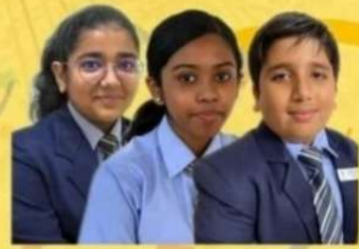
3rd Place - FALCON