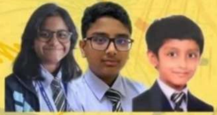
2nd Place - HORN BILLS