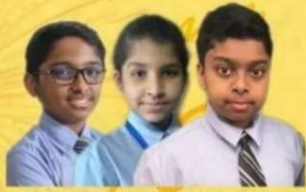
2nd Place - MACAW