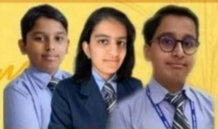
1st Place - FLAMINGO